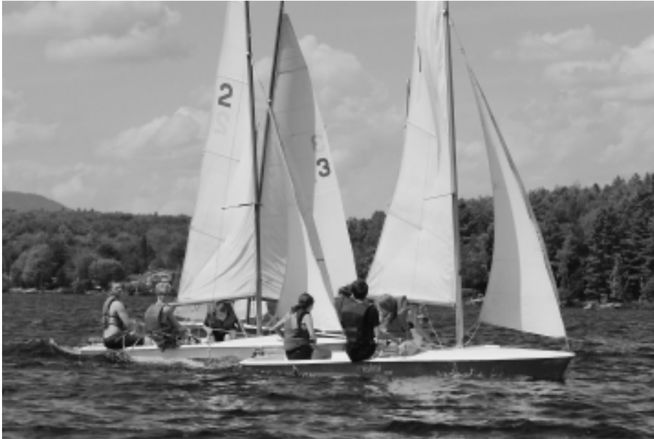
Several campers took part in Wednesday’s Regatta afternoon.